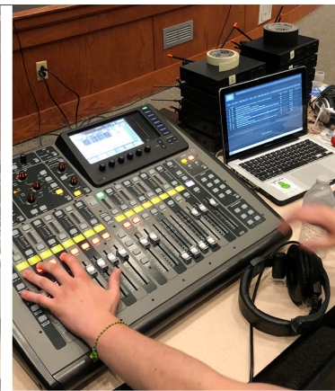
Los Osos High School Theatre

Purchase of welding equipment for a Technical Theatre Welding Shop